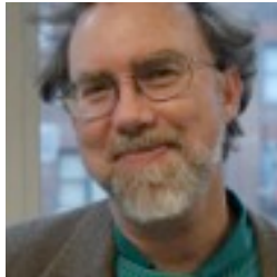
John Burroughs Lawyers Committee on Nuclear Policy