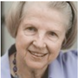
Sissela Bok Philosopher, author of A Strategy for Peace