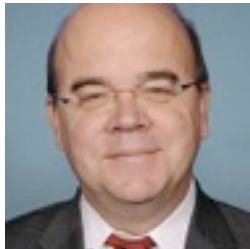
Jim McGovern US Congressional Representative