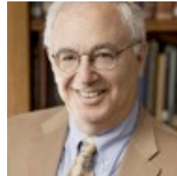
Bruce Ackerman Yale Law School