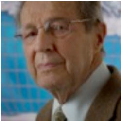
William Perry Former US Secretary of Defense